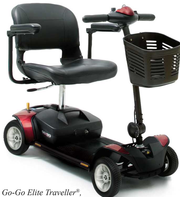
Go-Go Elite Traveller®, 4-Wheel