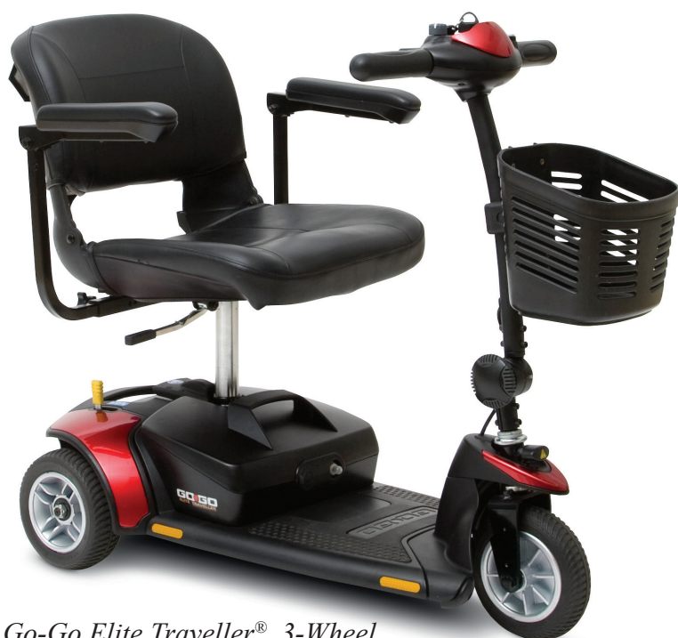
Go-Go Elite Traveller®, 3-Wheel

The compact design of the Go-Go Elite Traveller® allows it to easily manoeuvre in tight spaces while providing stable outdoor performance. The Go-Go Elite Traveller disassembles into 5 pieces, enabling a safe and efficient transition from car boot to on the road. Go where you want to go, easily, with the Go-Go Elite Traveller.