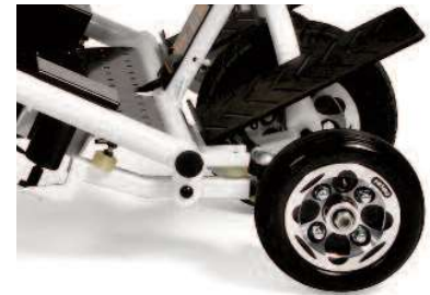
Quintell™ Non-Slip Adaptive Footplates Adjustable to match your measurements