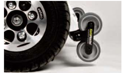
Quintell™ Kerbmaster™ Anti-tipping / Powered Anti-grounding