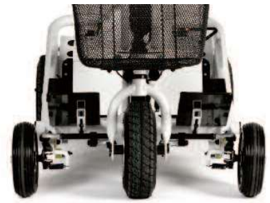
Quintell™ Solenoid Stabilising System Controls Active Tri-Wheel Steering