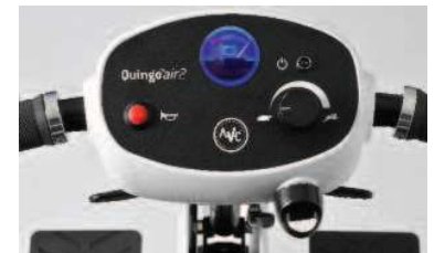
Simple to use ergonomic controls High security ignition & light-up battery gauge